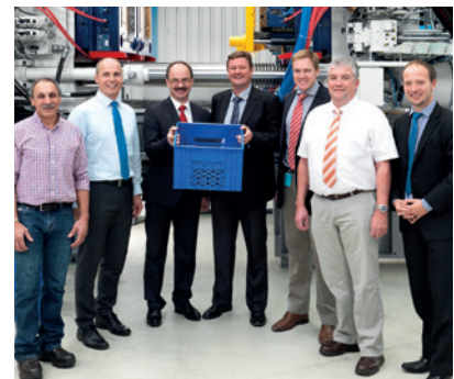
Succeeding together: The employees of MCG, Schoeller Allibert, KraussMaffei and P&CT