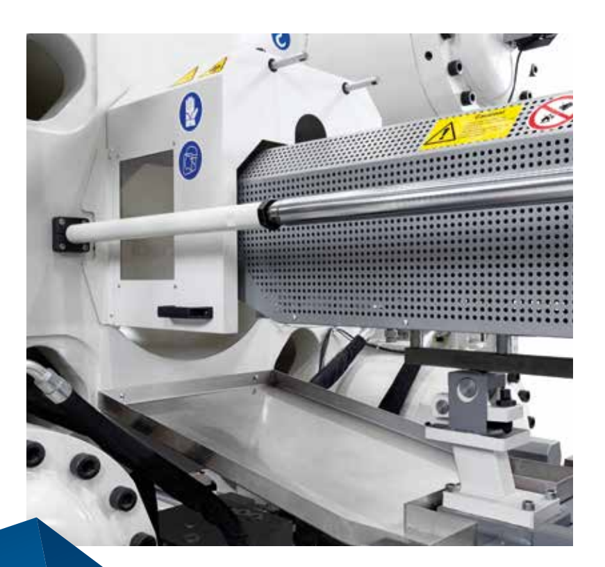
Easy and safe accessibility to the plasticizing unit